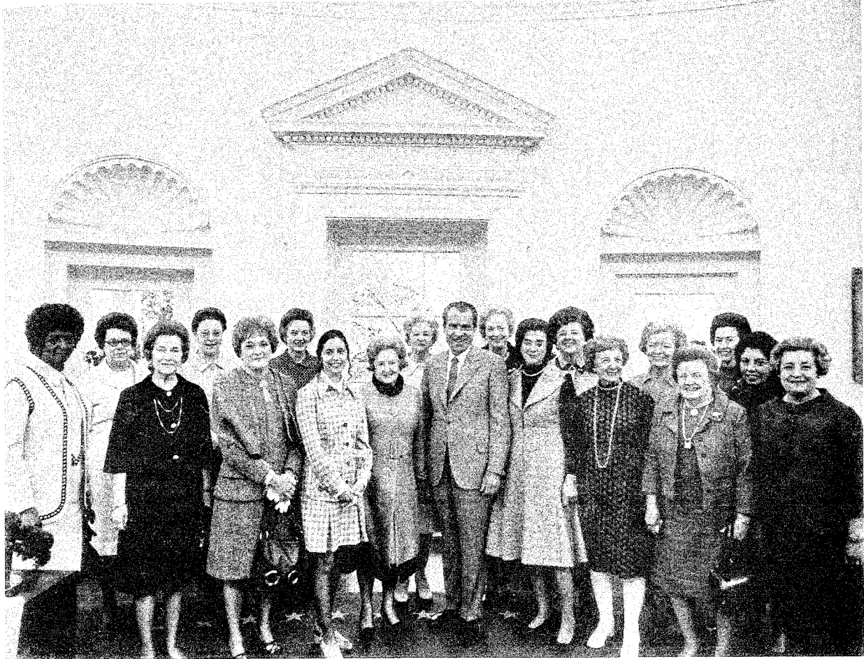
President Nixon meets with his Citizens' Advisory Council on the Status of Women.